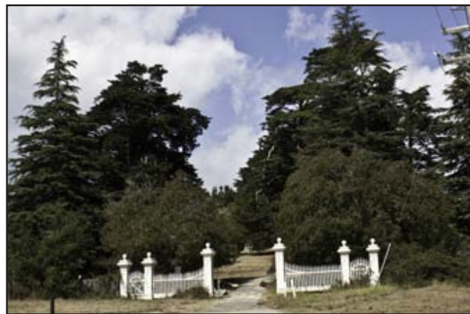
Entrance to path leading to Cardiff House, off High Street, 2009.