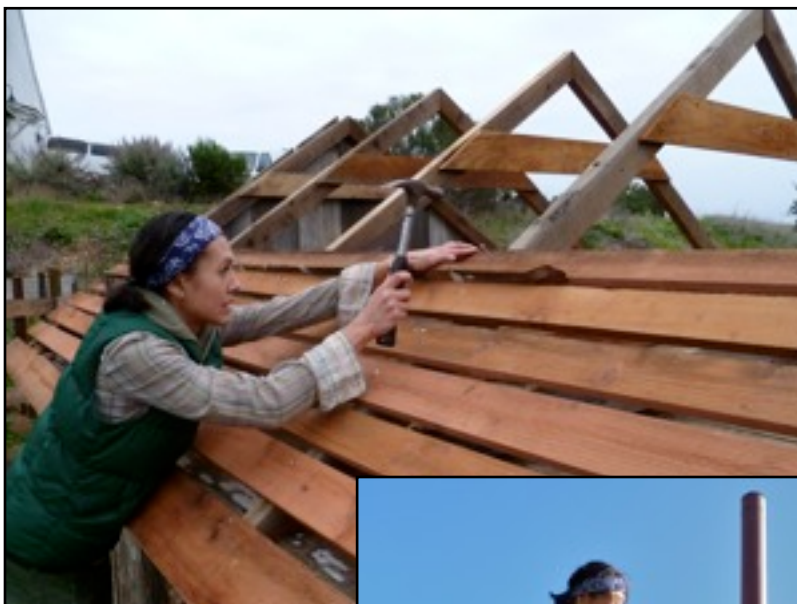
Nailing sheathing, north side.