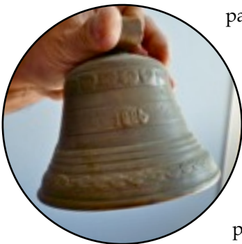
Bell used at the Cook House.