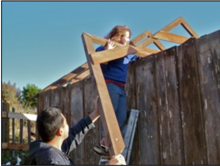
Lifting rafters into place.