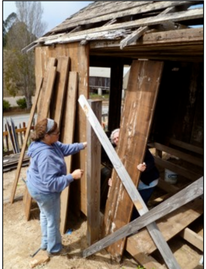
Installing siding, south side.