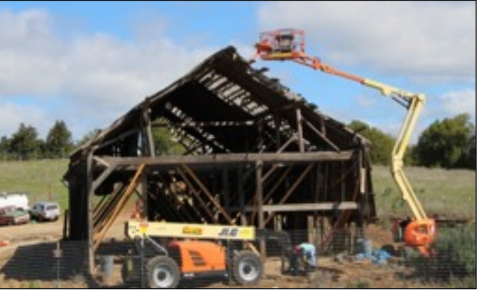
Removing skip sheathing from the roof. Originally the roof was shingled.