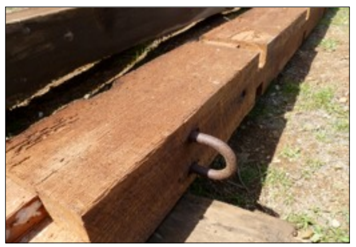
Ridge beam showing hook on underside.