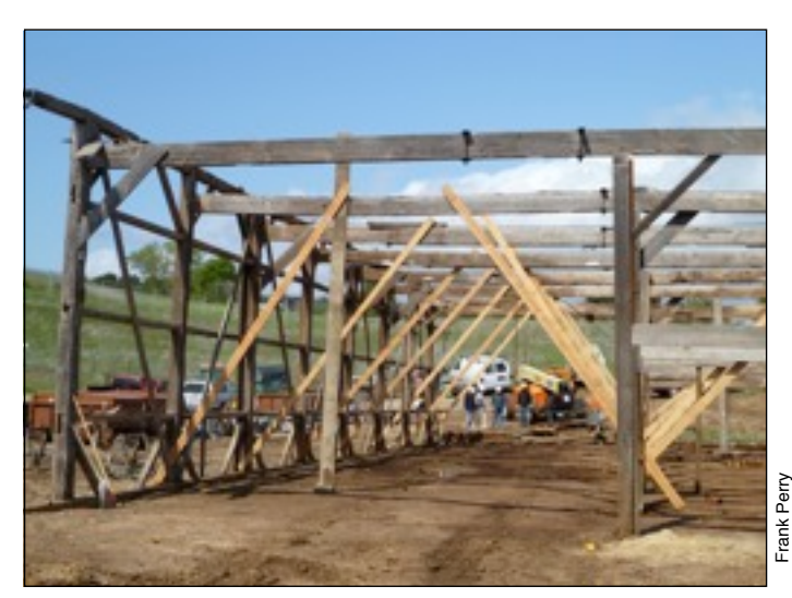
Temporary braces help hold the bents together until each is dismantled.