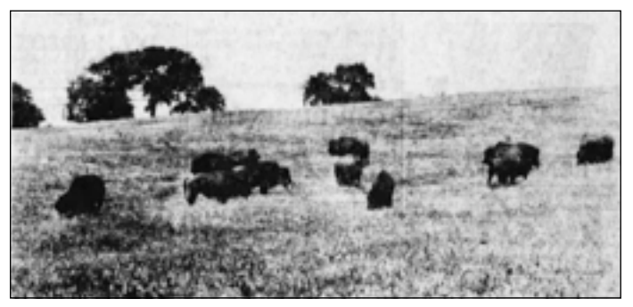
Cowell's buffalo herd at what is now Pogonip, 1932. Cowell had 13 bison at the time this photo was taken.

The following newspaper article was published January 6, 1932. It has been edited for clarity.