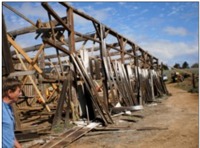
Removing siding from the east side. Original whitewash still coats the upper part of the boards where they were sheltered by the eaves.