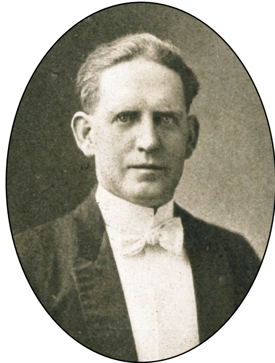
Elks Club program, 1921