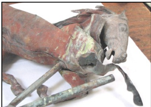
The Carriage House weathervane, before (left) and after repairs.