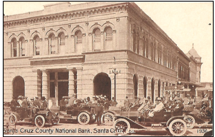
Santa Cruz County National Bank, later known as the County Bank, was located on the corner of Pacific Avenue and Cooper Street. The outer walls of the building were saved after the 1989 earthquake and incorporated into the present building, now home to Pacific Wave.