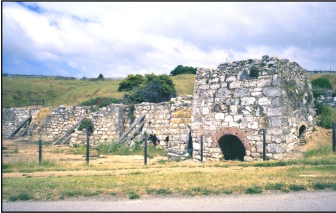
There are four lime kilns near the UCSC campus main entrance, all part of the Cowell Lime Works Historic District. On the right is the continuous kiln; to the left are three pot kilns.