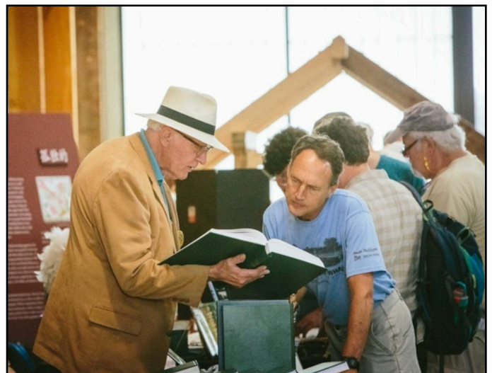
The Hihn Archives gives up some secrets.