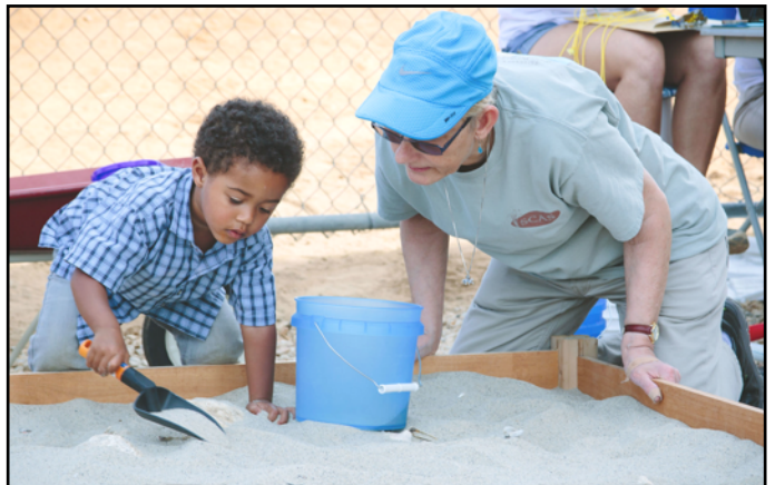
A young visitor practices archaeology techniques.