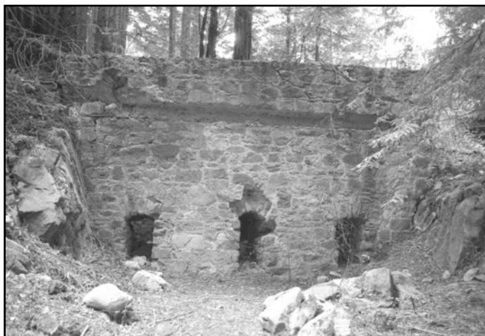
McLaughlin Bridge kiln.