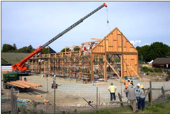
The Hay Barn as it looked during reconstruction.

Cabin B. This is one of two cabins still standing and is where some of the lime workers resided. Photographic evidence dates it and the adjacent Cabin A back to at least around 1910. The use of “square” nails would tend to indicate construction prior to 1900. Archaeological artifacts excavated by UCSC students push the date back even further. Study of these by archaeologist Patricia L. Paramoure for her Masters thesis points to occupation “from around 1870 to around 1940, with datable artifacts clustered between 1870 and 1911.”