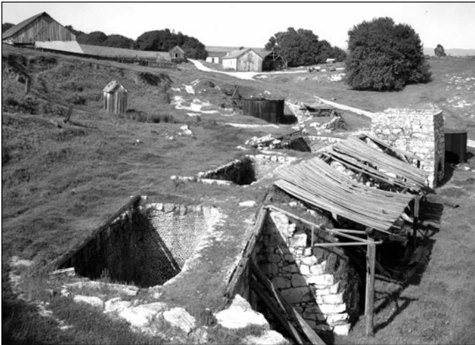
The three pot kilns near the campus entrance as they looked in about 1950.