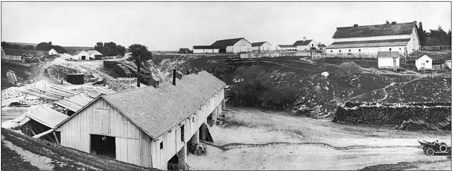
Panoramic view of the Cowell Lime Works, circa 1910. Although reproduced many times, this remarkable photo is worth examining closely. It remains a rich source of information on the nature of the operations at that time and shows several buildings still standing today.