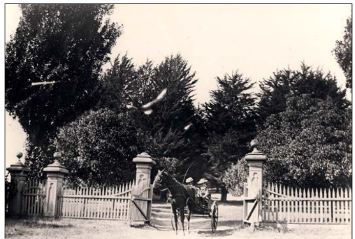
This is one of the few photographs that purportedly shows two of the Cowell sisters.