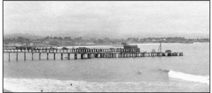
Capitola Historical Museum