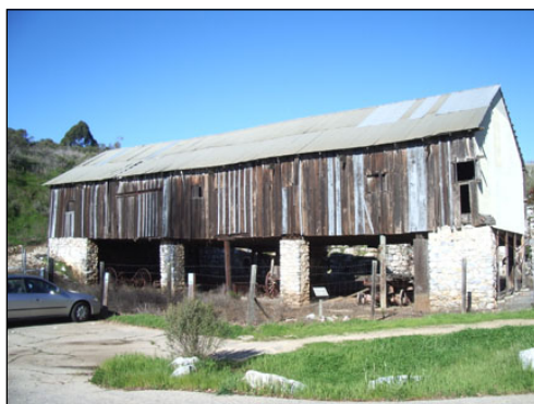
Cooperage in about 2006.

Back in the early 1960s, when UCSC was established, most of the historic structures on campus had not yet reached the century mark. Over fifty years later, all are well past 100 years old, and their historical value has risen immensely. Through a quirk of history, the most intact late nineteenth century lime manufacturing complex in California is on the campus of a modern university. Its placement on the National Register of Historic Places is well deserved.