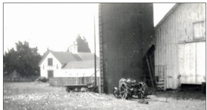
Silo next to Barn G. Carriage House in distance.

That was one of the major programs. They had it for depredating birds, gophers, and mice. In some counties, like Monterey County, we had an animal control program with people who just did coyote and lion control, anything involving stock depredation. There had to be a loss for us to respond to those types of calls.