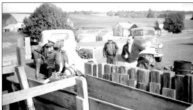
View of the Cowell Ranch, late 1950s. Hay barn and blacksmith shop can be seen in the distance.

RN: There has been a branch of my family consistently in Santa Cruz County, and specifically in Soquel, since 1850. My grandson is there now, and almost everyone was involved in some type of agriculture, whether it be timber, fruit crops, vegetables, or livestock. My grandson is raising a few hogs there. So they have some of their fingers in agriculture.