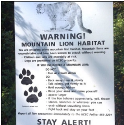
Mountain Lion warning sign at UCSC.

This county also had a trapper. While I was working for the County, we didn't have any mountain lions. There were no mountain lions seen then.