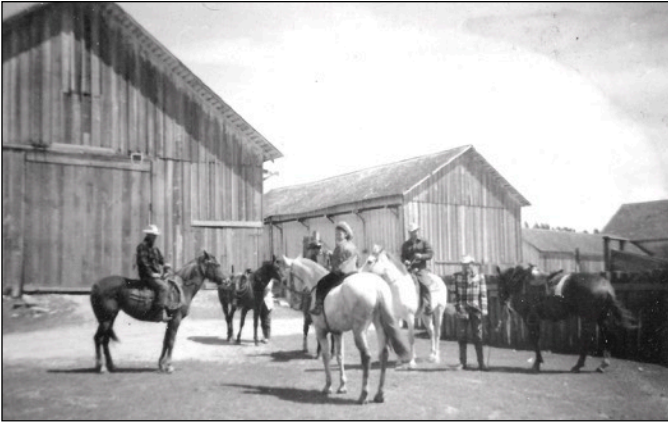
By the late 1950s the ranch was mostly used for raising cattle. Barn G is on the left. Carriage House would be just out of the picture on the right.

FP: He said it was oat hay. He said at first when they started working there it wasn't clean hay. It had a lot of weeds.