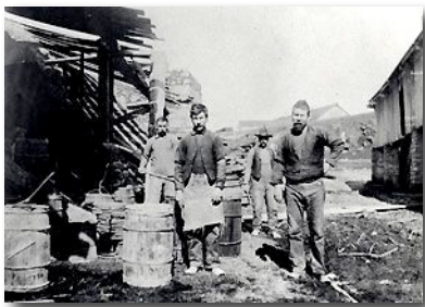
Workers preparing to load lime barrels for shipment.

Lime played a vital role in California history from the Mission era into the early 1900s. As the principal ingredient of mortar, plaster, and stucco, lime was critical to the development of California's cities and towns. Historic lime kilns, quiet reminders of the lime industry, remain standing in many areas of the state, some of them in parks.