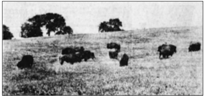
Cowell's buffalo herd at what is now Pogonip, 1932. Cowell had 13 bison at the time this photo was taken.

The following newspaper article was published January 6, 1932. It has been edited for clarity.