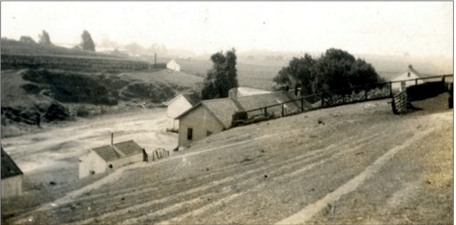
This view, probably from the late 1920s or 1930s, looks toward the southeast and shows the cook house (center). To the right is a garden, and nearby are several small buildings that no longer exist. Today's "Barn Theater" is on the far right. In the distance, just left of center, is a white building with a smokestack. This is probably the barrel mill, which burned before the University acquired the property. The smokestack was for a steam engine that ran a stave machine.

Friends of the Cowell Lime Works Historic District Mail Stop PP&C University of California Santa Cruz, CA 95064