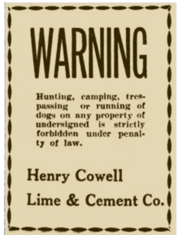
Jan. 24, 1925