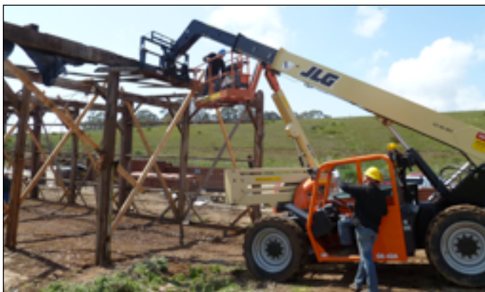
More barn photos on page 5

One of the barn's most unusual features is the ridge beam. During construction, this beam helped hold the rafters in place along the roof ridge until the sheathing was installed. Most barn ridge beams are only an inch thick. This beam, however, is massive and notched for the rafters. There are also large hooks on the under side. It is unclear why it was built in such an unusual fashion. Perhaps it was used for heavy lifting of some kind.