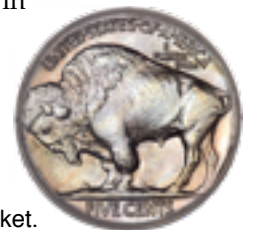
In the 1930s there was a buffalo in almost every pocket.