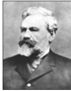
Santa Cruz Museum of Art & History