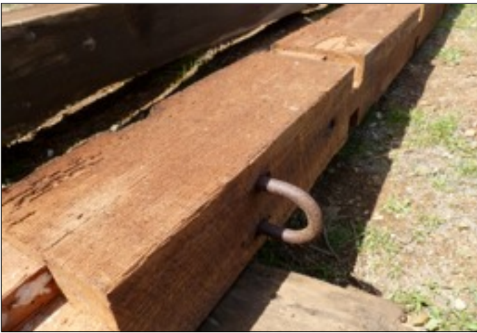
Ridge beam showing hook on underside.