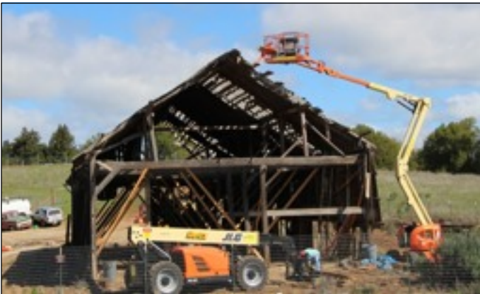
Removing skip sheathing from the roof. Originally the roof was shingled.