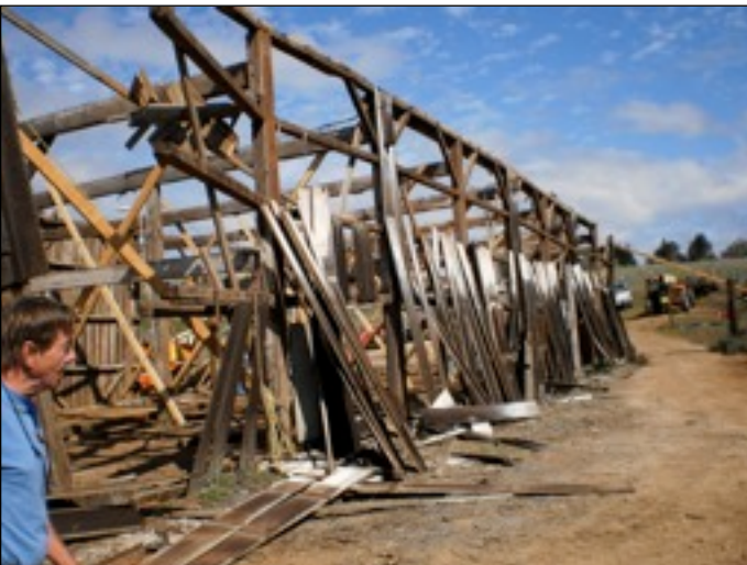
Removing siding from the east side. Original whitewash still coats the upper part of the boards where they were sheltered by the eaves.