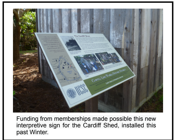
Funding from memberships made possible this new interpretive sign for the Cardiff Shed, installed this past Winter.