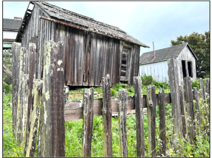
Lichens growing on the old picket fence near Cabin A.

Lichens typically fall into three basic categories—crustose, foliose, and fruticose—each having their own structure, shape, and environmental preference to call home. Generally, crustose lichens are small and often