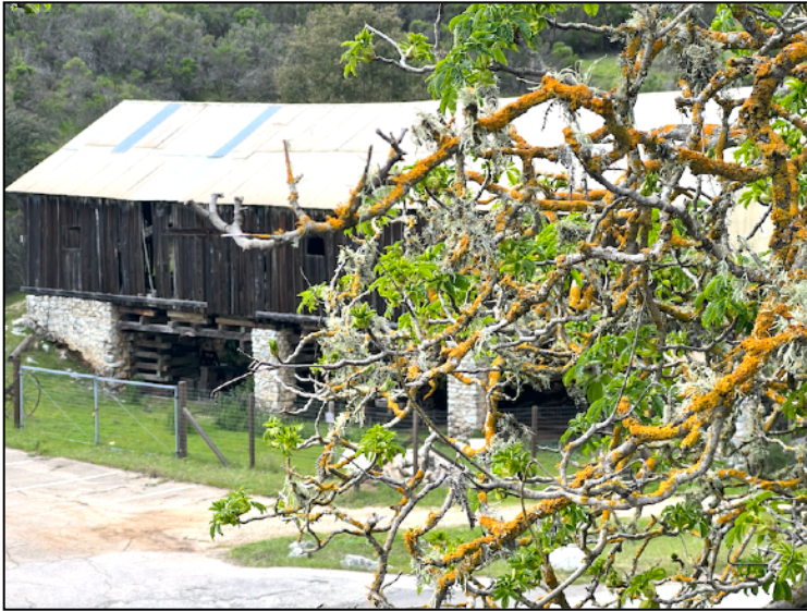
Lichens growing on the Buckeye tree near the cabins.

types of lichens were a source of food. Due to the lack of detailed records, there is no way of knowing the number of species or density of lichens found in the 1850s. Moreover, lichens are greatly influenced by temperature, air quality, and moisture content in the air, which would have a profound impact on their growth back then as it does today.